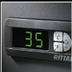
► Comfort Controller