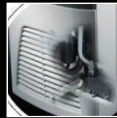
► Integrated condensate evaporator