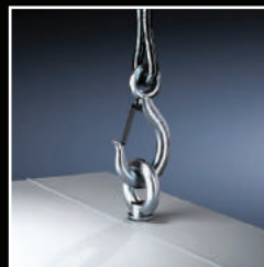
► Eye Bolt (>1.000 W)