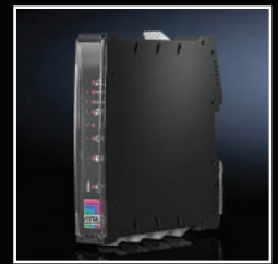
► IoT Interface compatible